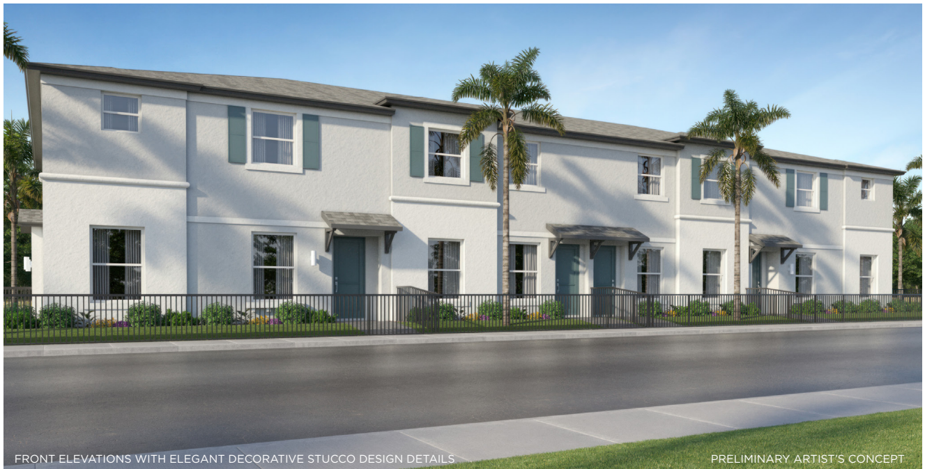
FRONT ELEVATIONS WITH ELEGANT DÉCORATIVE STUCCO DESIGN DETAILS